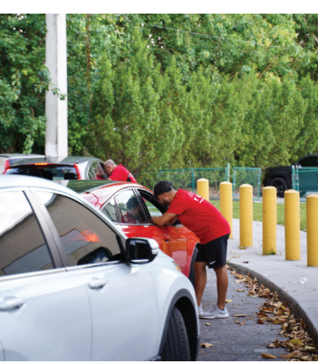
07/16/22 9:15 AM