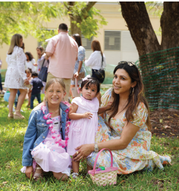
05/21/22 7:10 PM