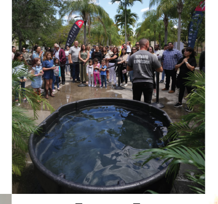
04/10/22 12:48 PM