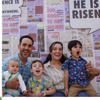
04/10/22 12:52 PM