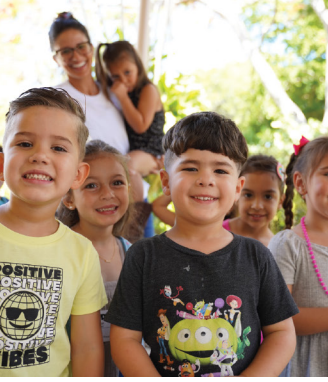
06/05/22 10:56 AM