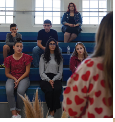
02/06/22 11:08 AM