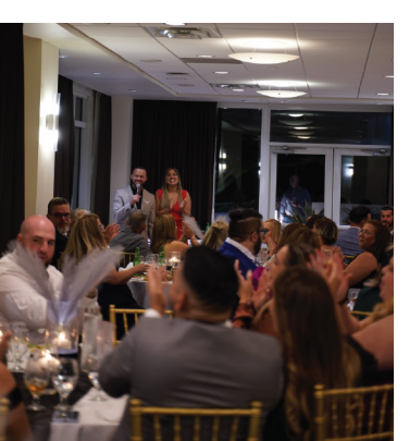
11/20/22 11:02 AM