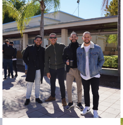
01/30/22 11:50 AM