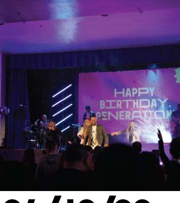
01/23/22 11:34 AM